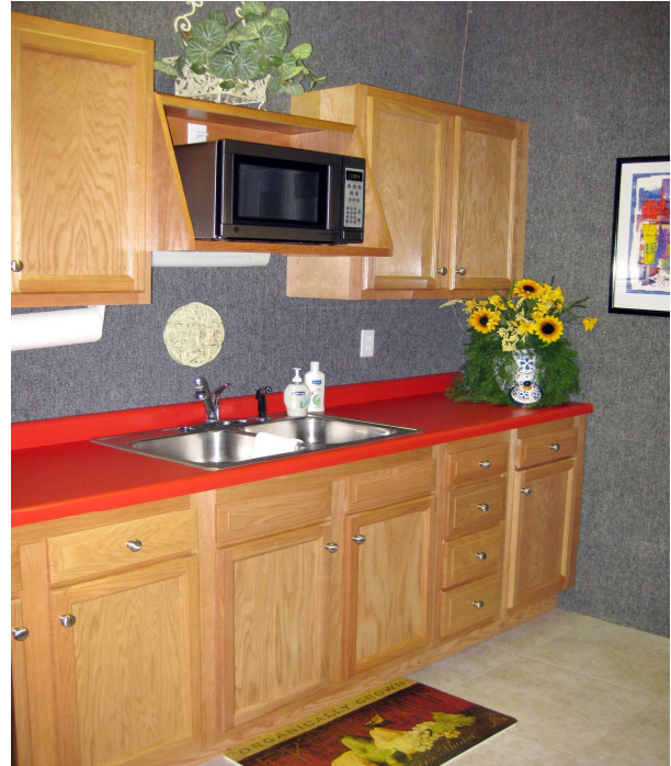
The new kitchen is up and running. Thank you to everyone who has helped to make this possible.

Thank you to those of you who prayed with us, gave money or helped in any other way.